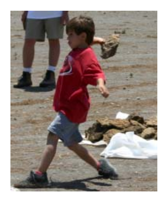
Tossing Cow Chips